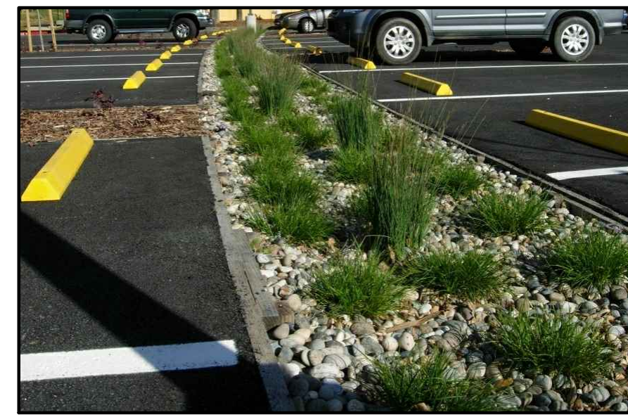
STONE / VEGETATED BIO-RETENTION SWALE