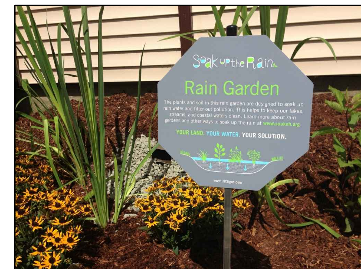
RAIN GARDEN/BIO-RETENTION SWALE EDUCATIONAL SIGNS

PROJECT INFORMATION: FILE PATH: G:\Projects\WMSHG1801\Plans\Joshua Road Library\... FILE NAME: EXHIBIT 7-3-2018.dwg DATE PLOTTED: 06 Jul 2018, 3:08PM LAST SAVE BY: FGBR