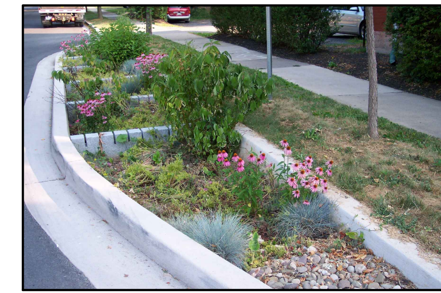
BIO-SWALE/ RAIN GARDEN