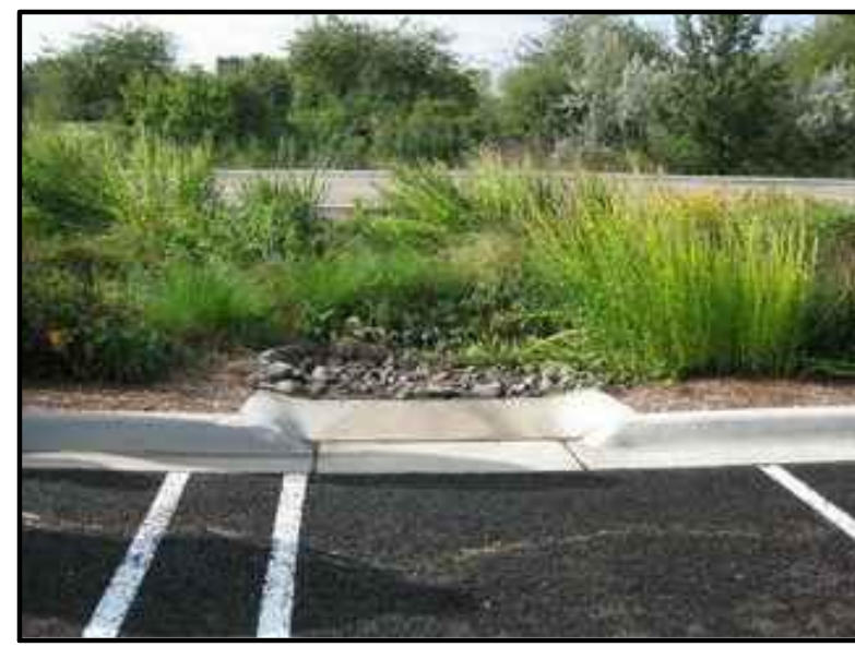
DRAINAGE CURB CUT